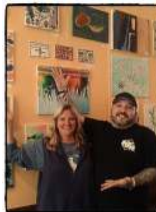
...and a couple of artsy types!