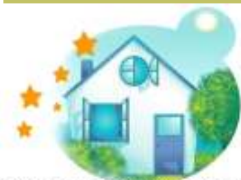
B.S.S. Residential Services