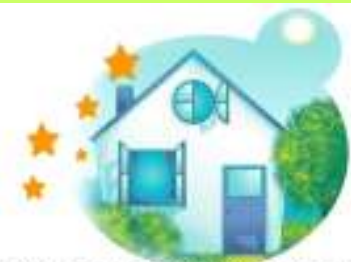
B.S.S. Residential Services