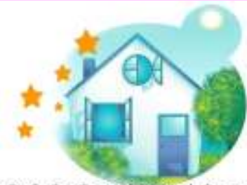
B.S.S. Residential Services