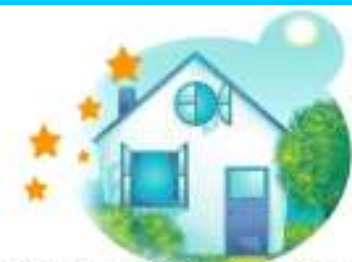
B.S.S. Residential Services