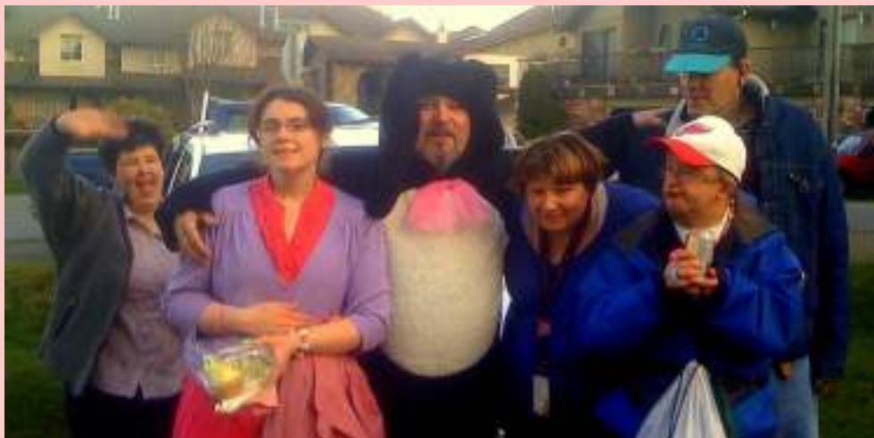
(The BSS Easter Party. Eggs-ackly what the Bunny ordered for 2012!)

In May, we have a Tamarack/Carey house BBQ on the 30th. Our June Aboriginal-themed BBQ will be on the 28th. In the summer months, we have a few events that our friends and families will not want to miss including the Annual Becon Support Services Friends and Family BBQ at Centennial Park in Central Sannich on July 14th at 11:00. Otherwise, we are looking forward to more floor hockey, monthly potlucks, monthly arts-and-crafts clubbing, trips to Butchart Gardens, go-carting, mini-golfing, beaching it, and many summer activities together. What a way to StayConnected during the summer months!